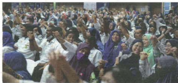
During the two-day conference, counselling teachers attended forums and workshops that provided skills and tools to guide their students to understand early signs of a mental health crisis, including guidance on intervention skills for more severe mental health problems.

"This is to support the country's aspiration to focus on introducing digital education that can help improve preparation through reality and practical exposure to potential future