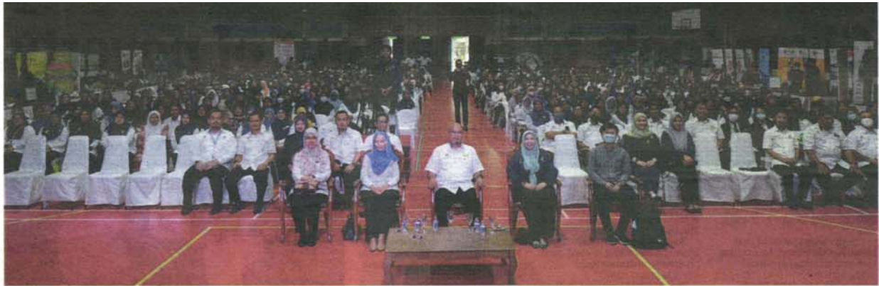
More than 1,000 educators attended the H.A.P.P.Y. mental health awareness counselling conference organised by EduCity and JPNJ.