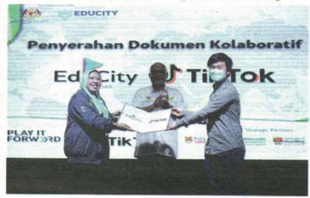
The launch also coincided with the announcement of a collaboration between EduCity and TikTok, which will see a joint effort to produce content with a high educational value.